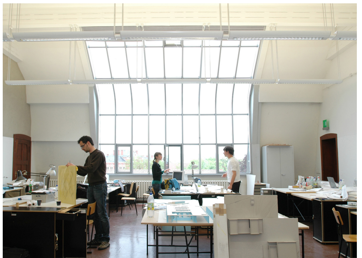
Workspaces of the Faculty of Architecture

The Bauhaus-Institute for Theory and History of Architecture and Planning brings together researchers and academics from numerous disciplines focusing on the investigation of different aspects of the history of architecture, heritage and urbanism and not only of the historic Bauhaus. In conferences, workshops, colloquia, joint research activities and classes, an intense discussion on the latest research activities takes place. Joint research proposals led to two projects funded by the Deutsche