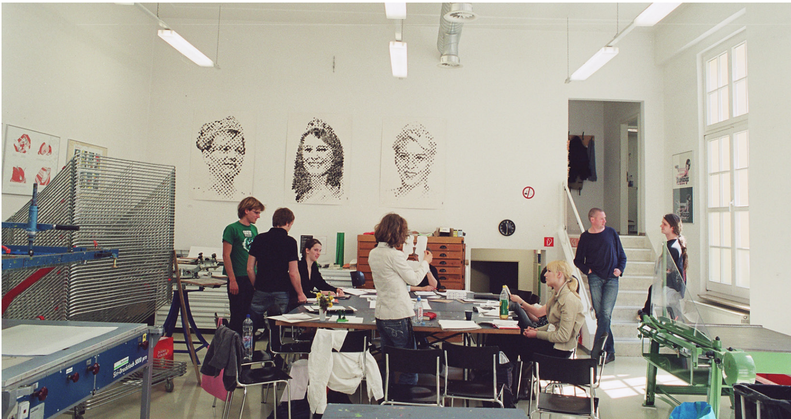
Workspaces of the Faculty of Architecture