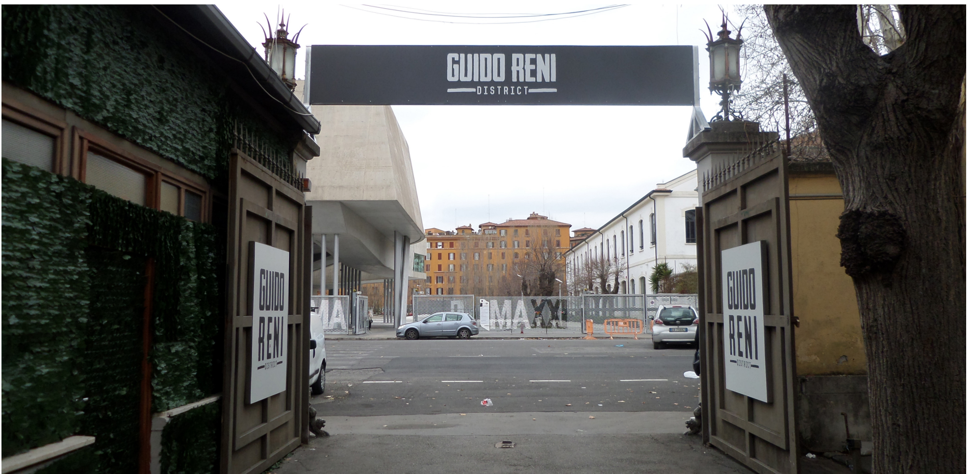
A view of the MAXXI museum (former Montello barracks) from the former Guido Reni barracks in Rome