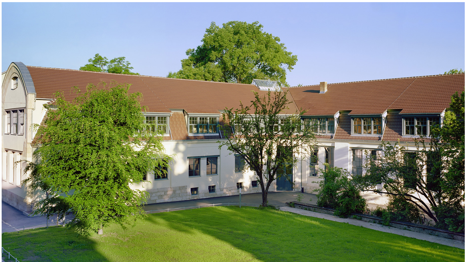
The Van-de-Velde Building

Up to 15 researchers, among them our four urbanHIST researchers, do have their own office spaces directly on the Campus next to the famous main building and the Bauhaus-Atelier, the cafeteria of Gropius' times which nowadays is a café and a shop.