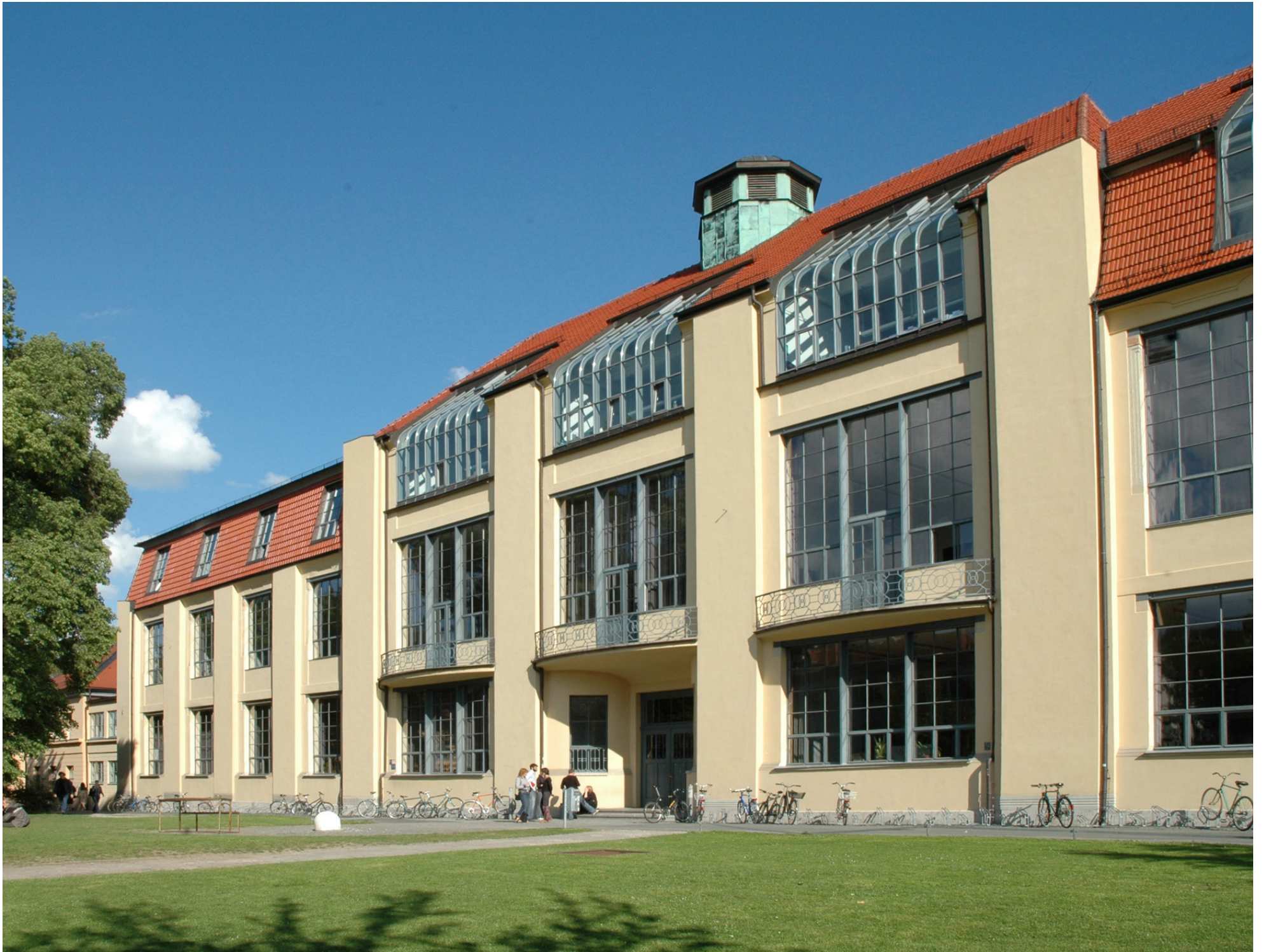
Bauhaus-Universität Weimar, Main building