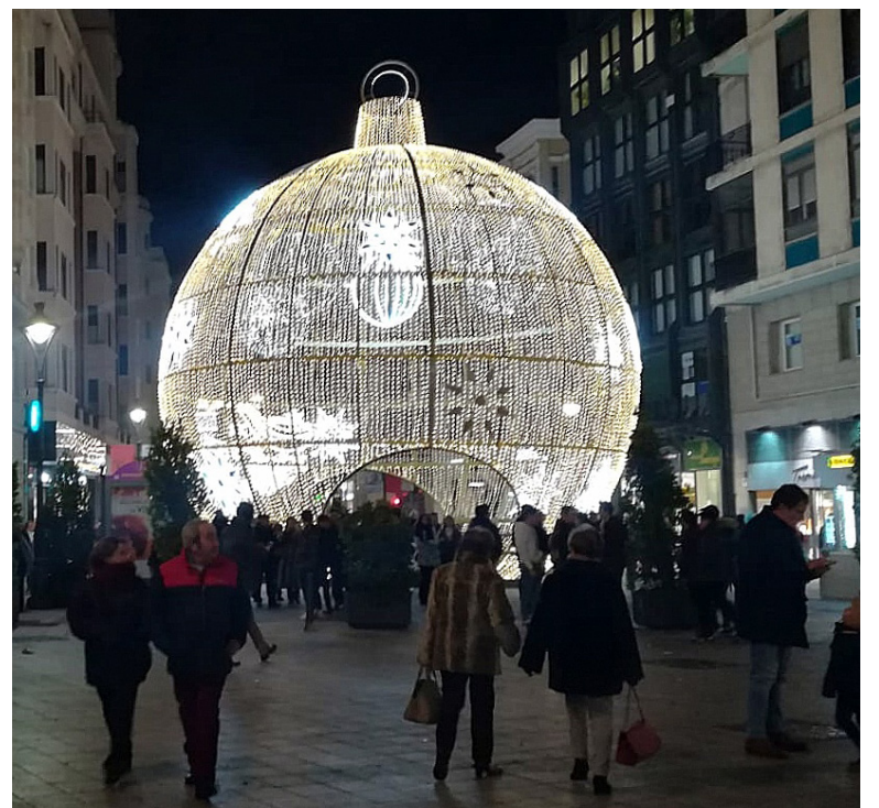
Bola