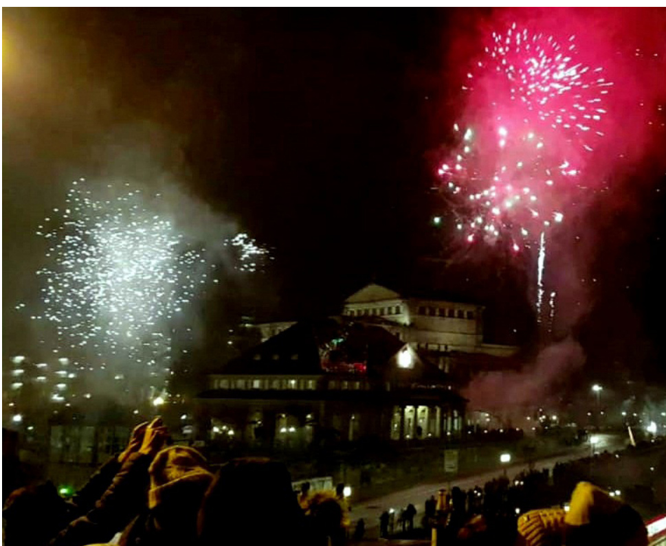
Firework on the bridge