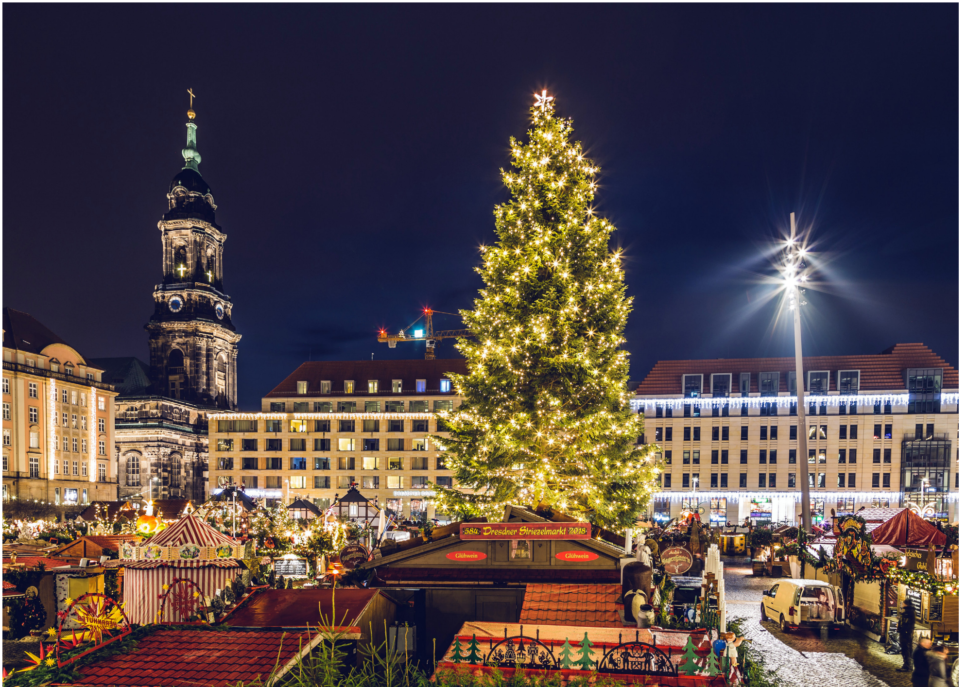
Christmas market on Altmarkt

Elvira Khairullina Early Stage Researcher