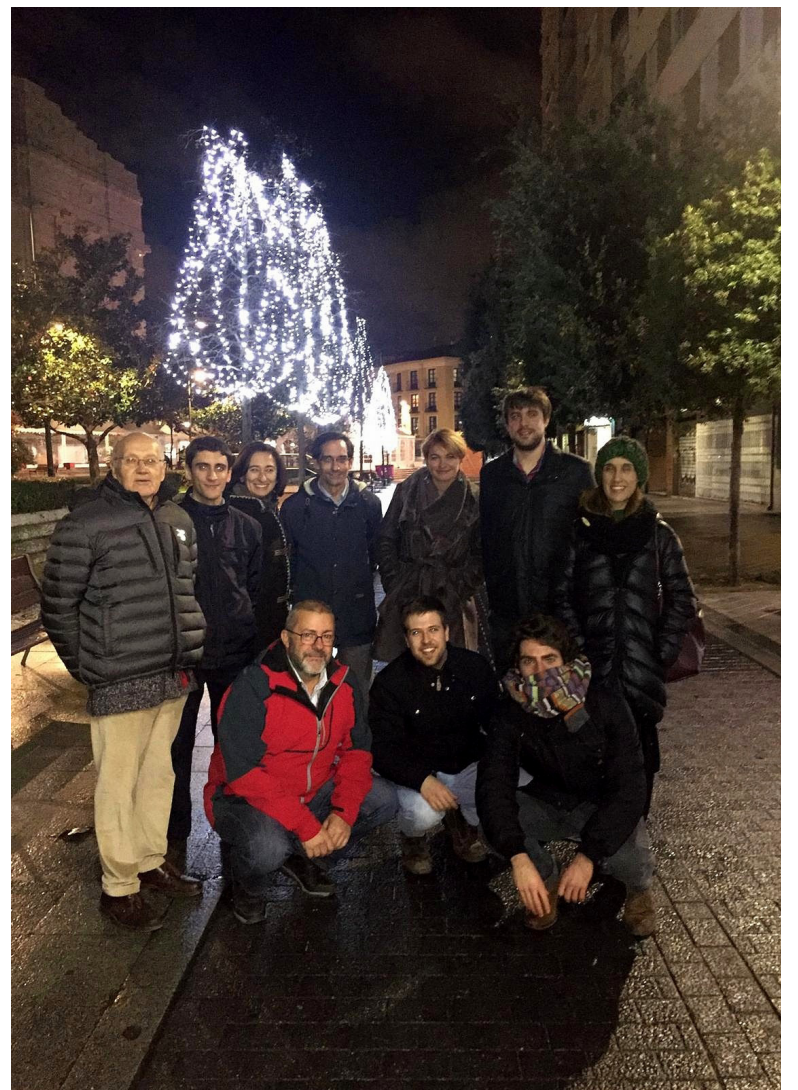
Team UVa