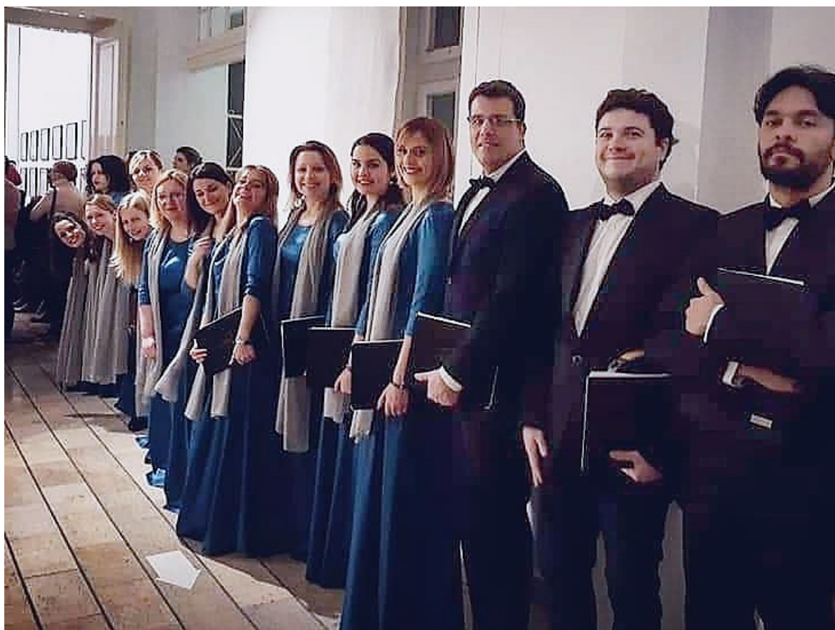
Choir Sveti Roman Slatkopojac before the Christmas concert