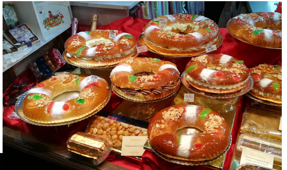
Roscones: Typical Christmas sweet in Spain for the Day of Wise kings, 6 January