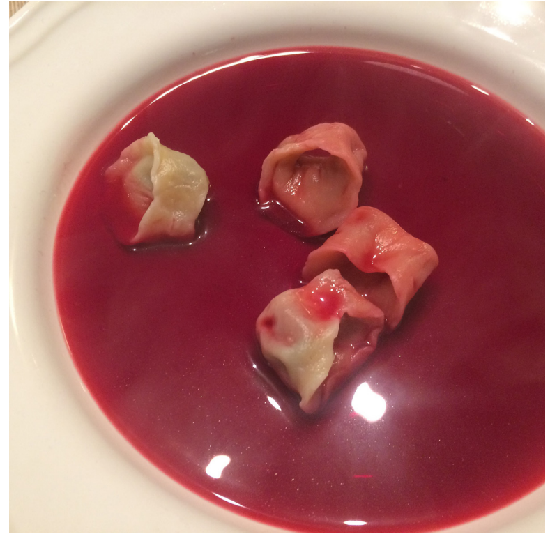
Barszcz z uszkami, a type of Polish tortellini with beetroot soup