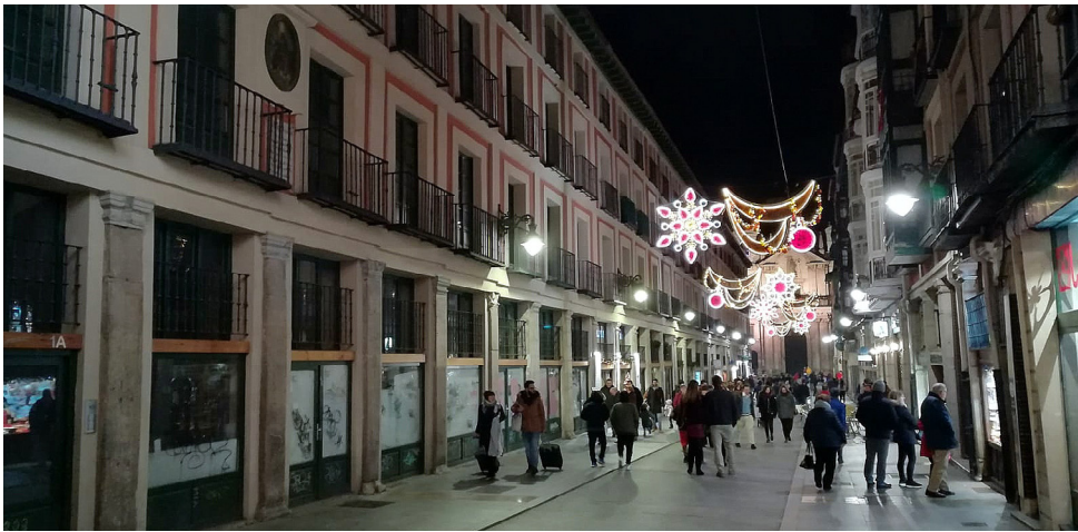
Calle Platerias | Photo by María A. Castrillo