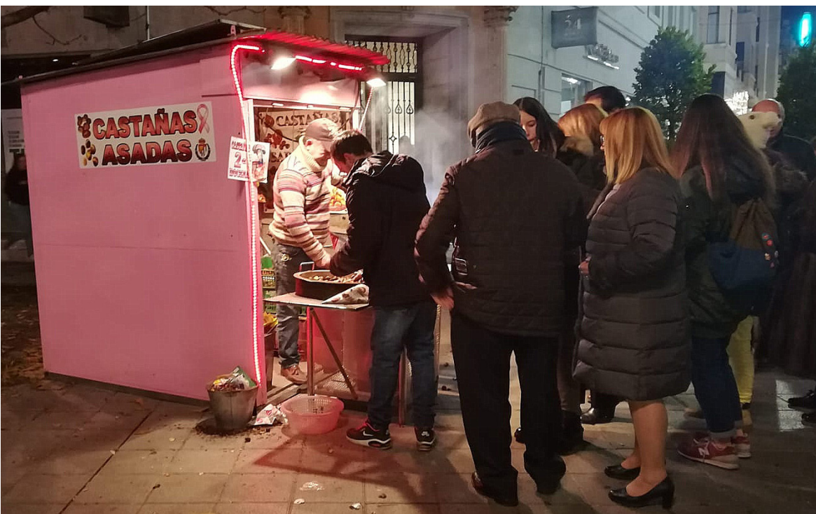
Castañas (Chestnut): Typical autumn-winter fruit