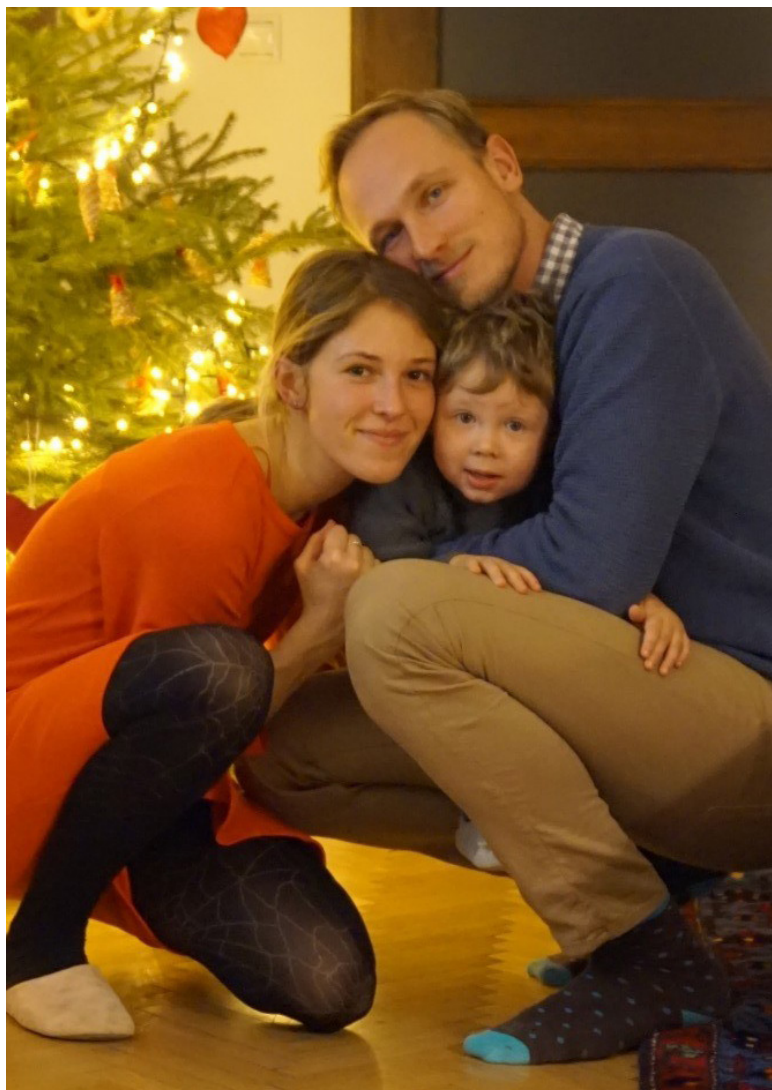
Christmas Eve family photo