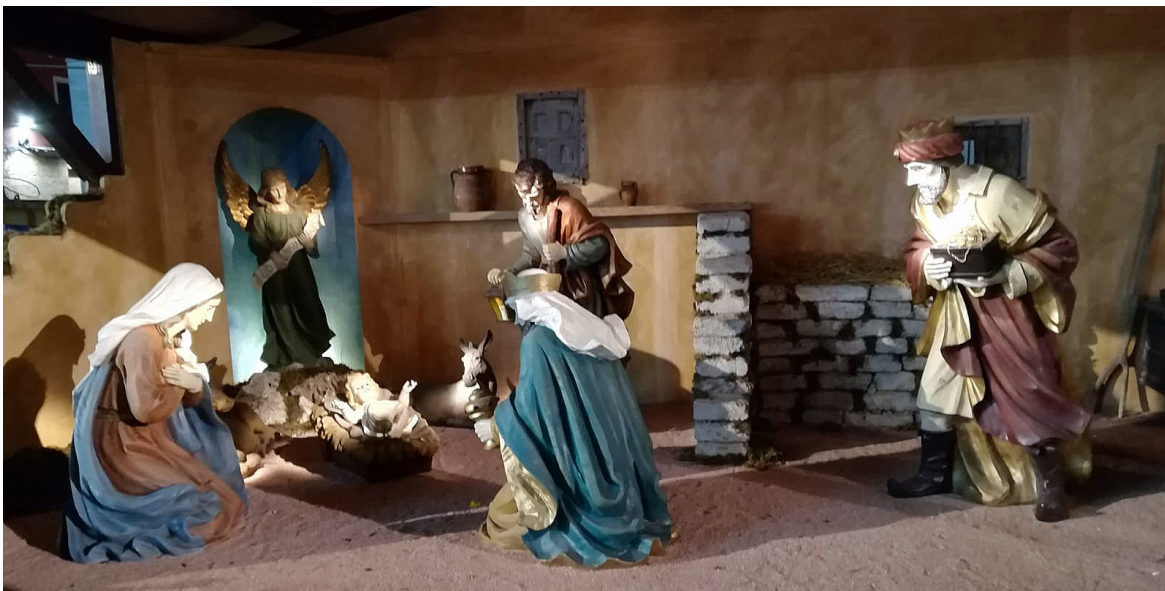
Portal