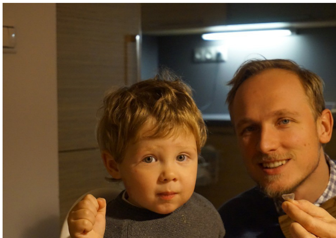
Carp scale with its magical power of attracting money