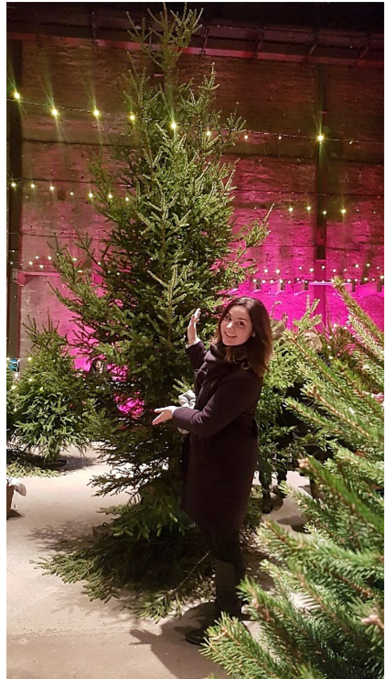
Christmas trees at Christmas market on Södermalm