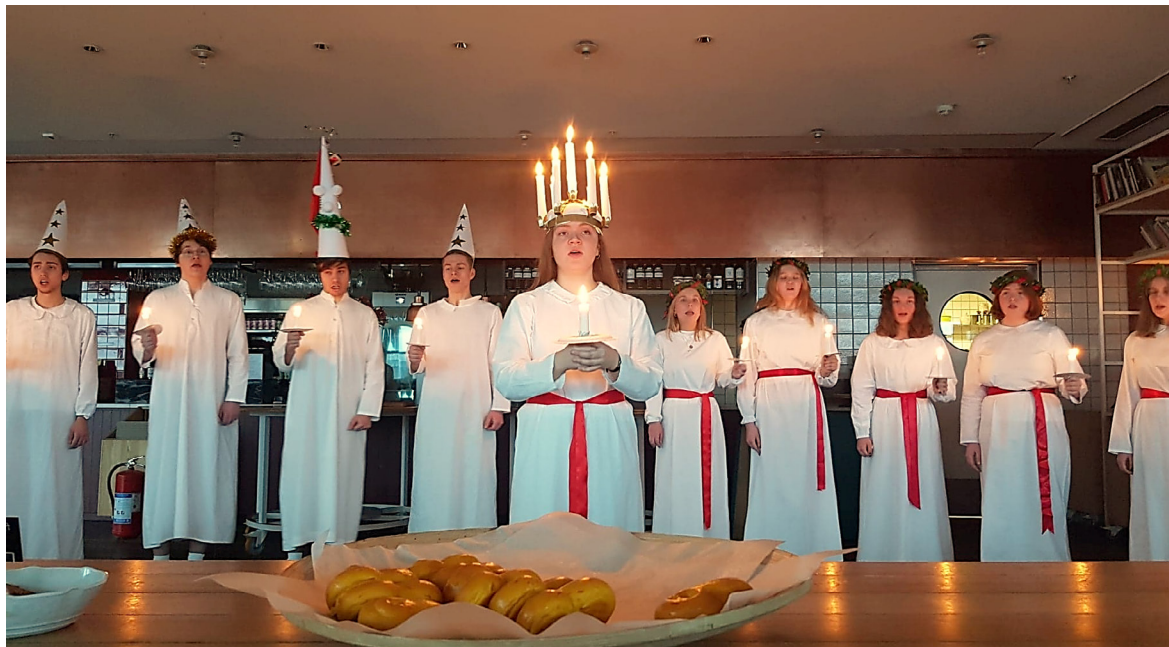
St. Lucia choir performance and fika with Lussekatter in Moderna museet