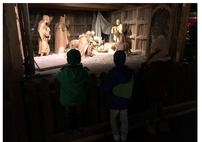
Christmas Market Erfurt | Photo by Susanna Weddige