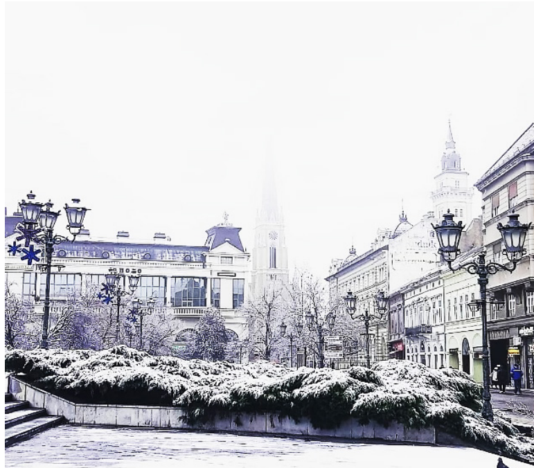
Center of Novi Sad covered with snow