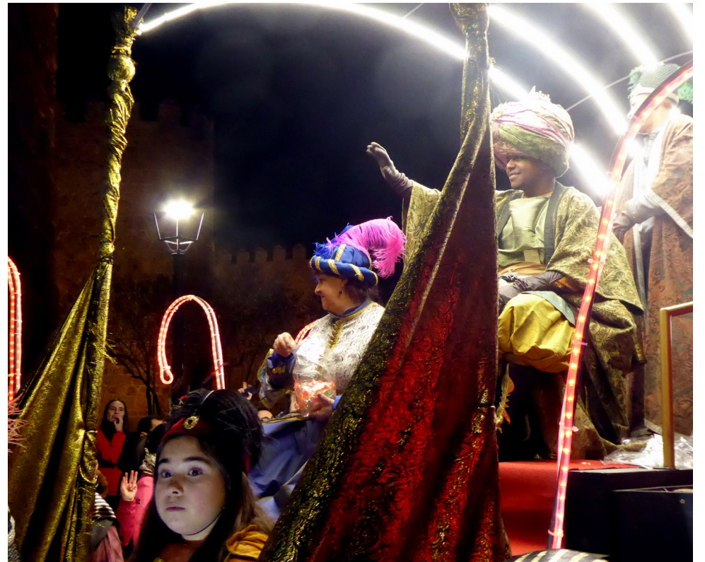
Typical cavalcade of the three wise kings (here King Baltasar) in Avila