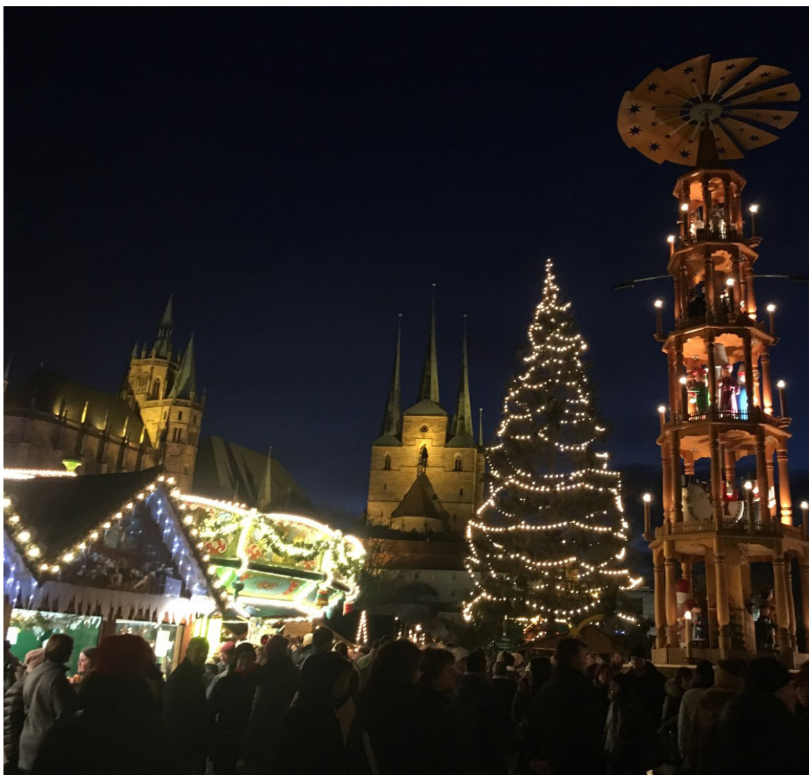
Christmas Market Erfurt