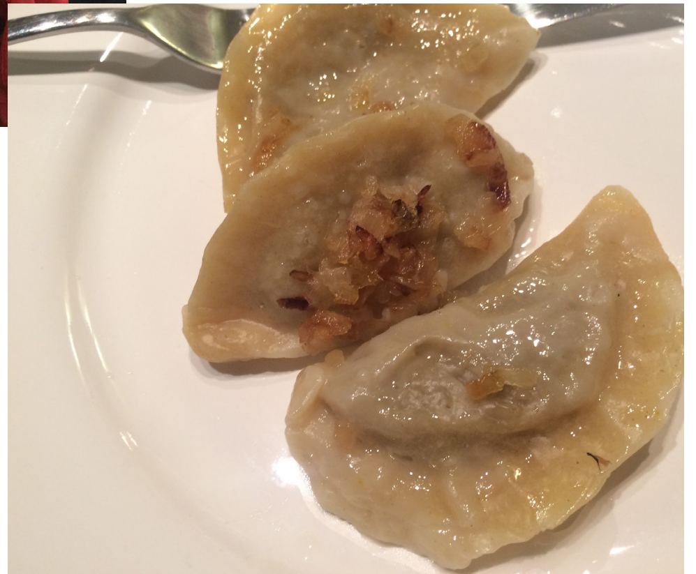
The best mushroom pierogi I ever tasted with a sprinkling of fried onions