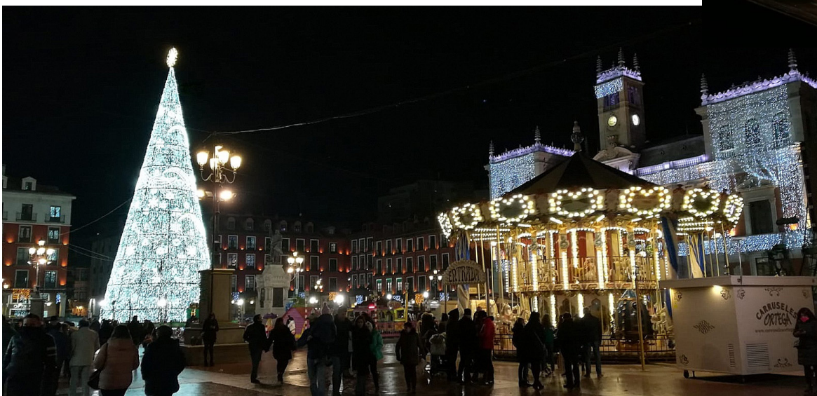
Plaza Mayor