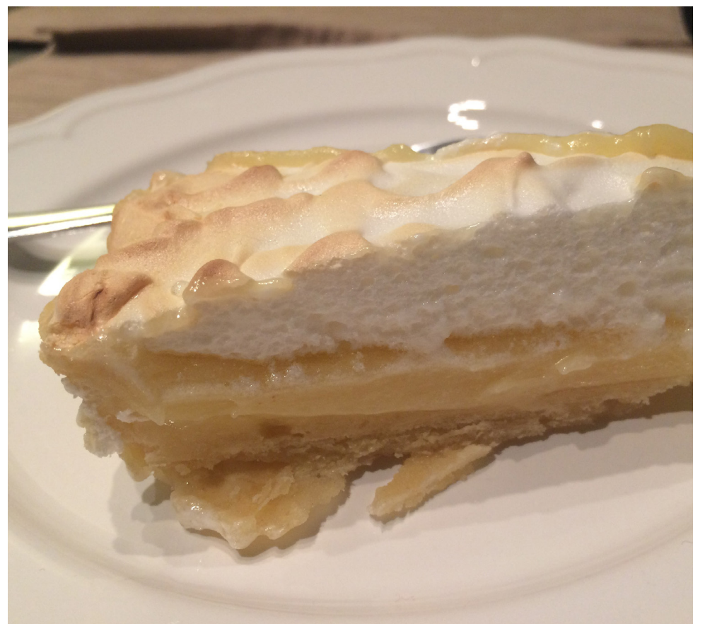
Agnès Dudych's delicious lemon meringue cake