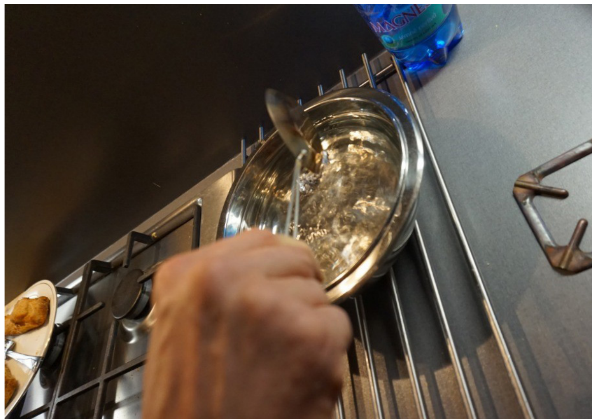
Lead pouring