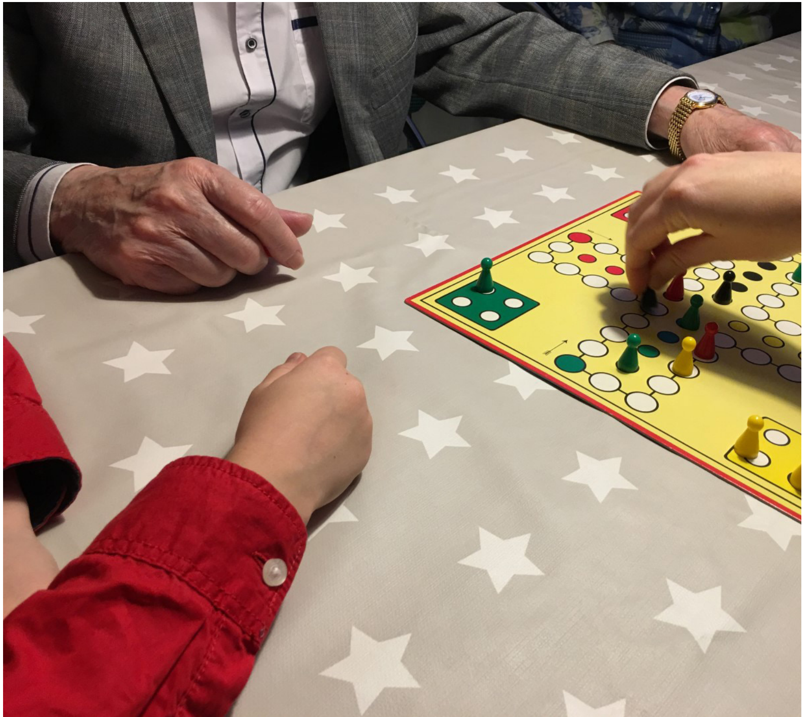
Board Games