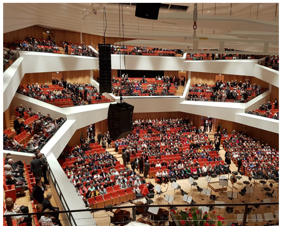
Dresden Kulturpalast concert