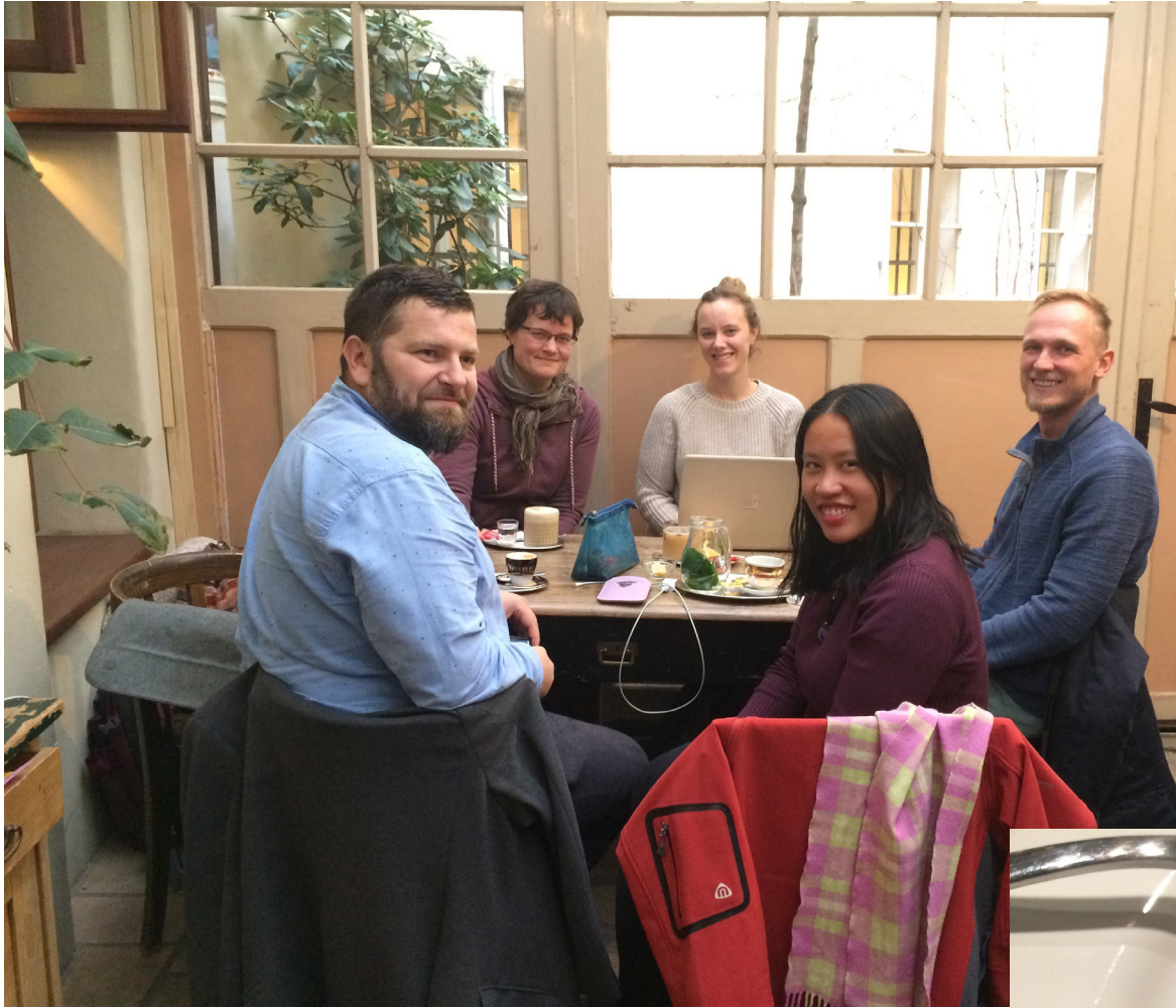
The five ESRs during one of their weekly colloquiums in Prague