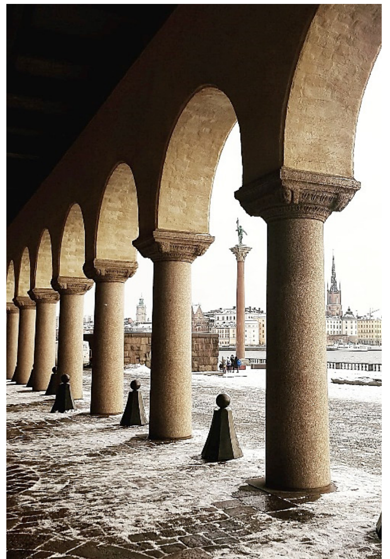
Stockholm from below the arches of the City Hall