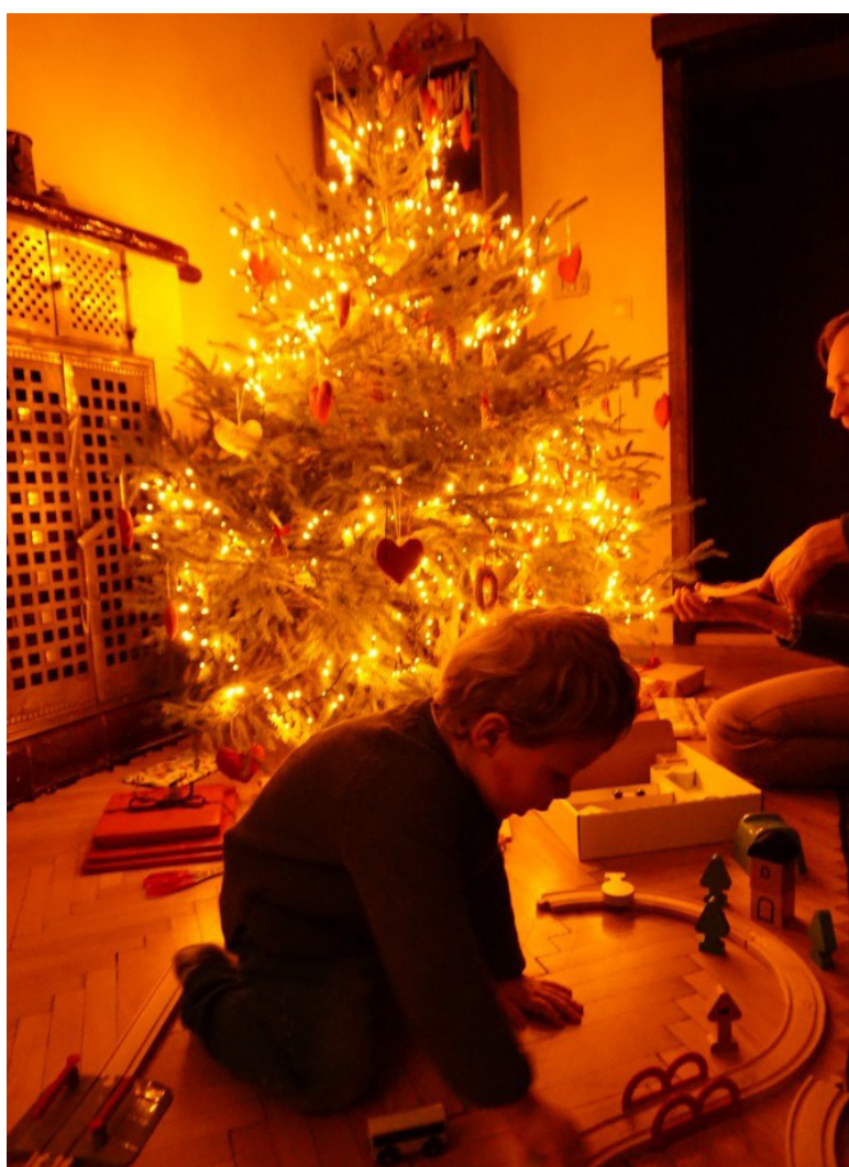
The best gift – a railway kit