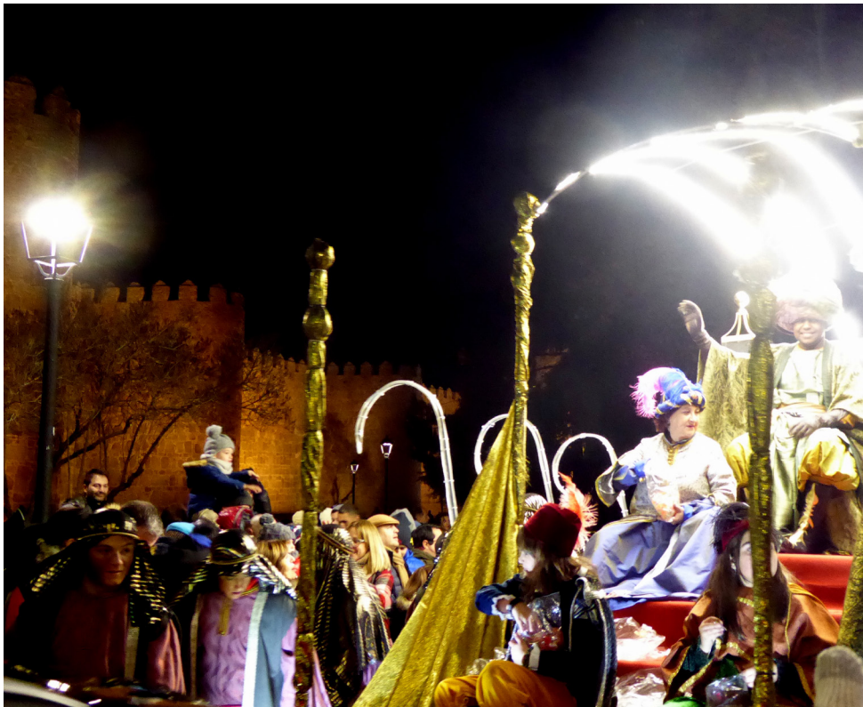
Typical cavalcade of the three wise kings (here King Baltasar) in Avila