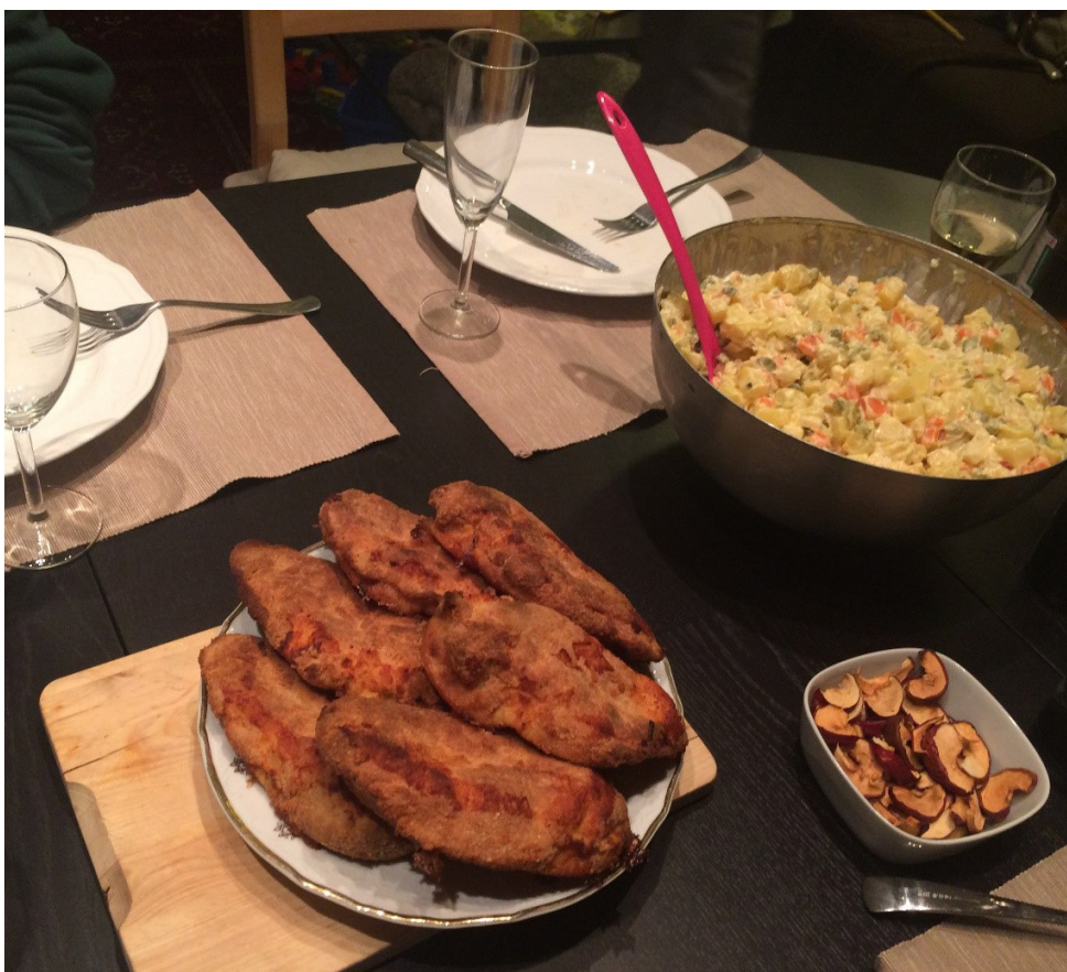
Chicken řízek (schnitzel) with potato salad