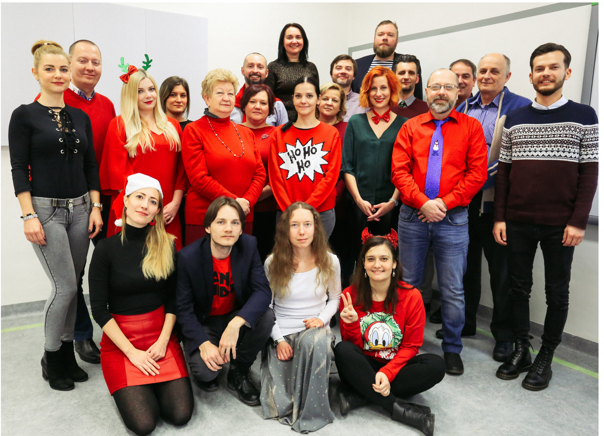
Members of the Department of History, Faculty of Arts at Pavol Jozef Šafárik University in Košice