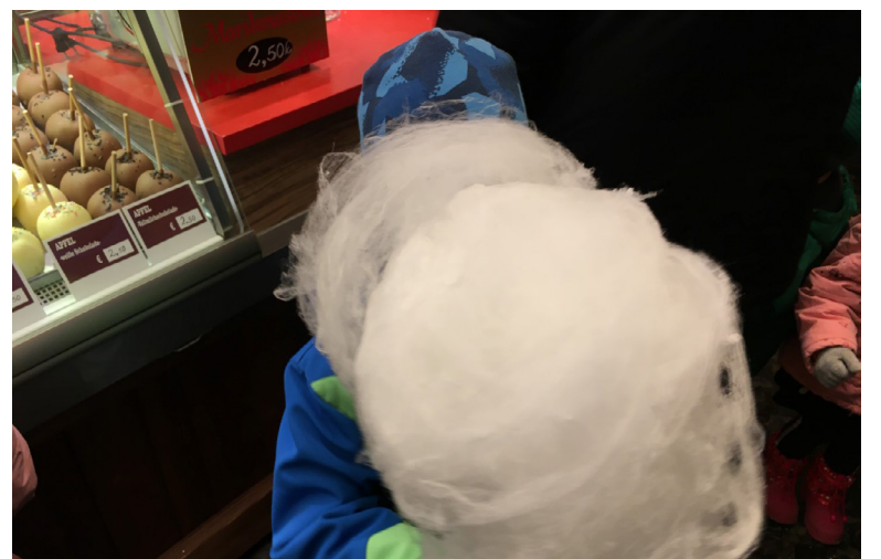
Christmas Market Erfurt